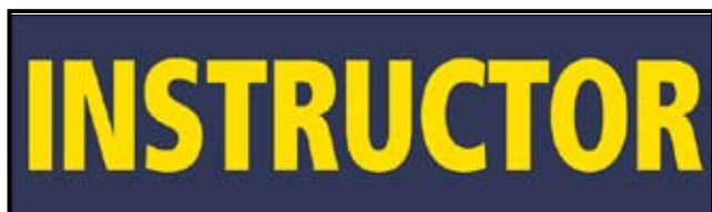
BACK OF T-SHIRT (ACROSS SHOULDERS)

Screenprinted, Heavyweight 100% Cotton T-shirt